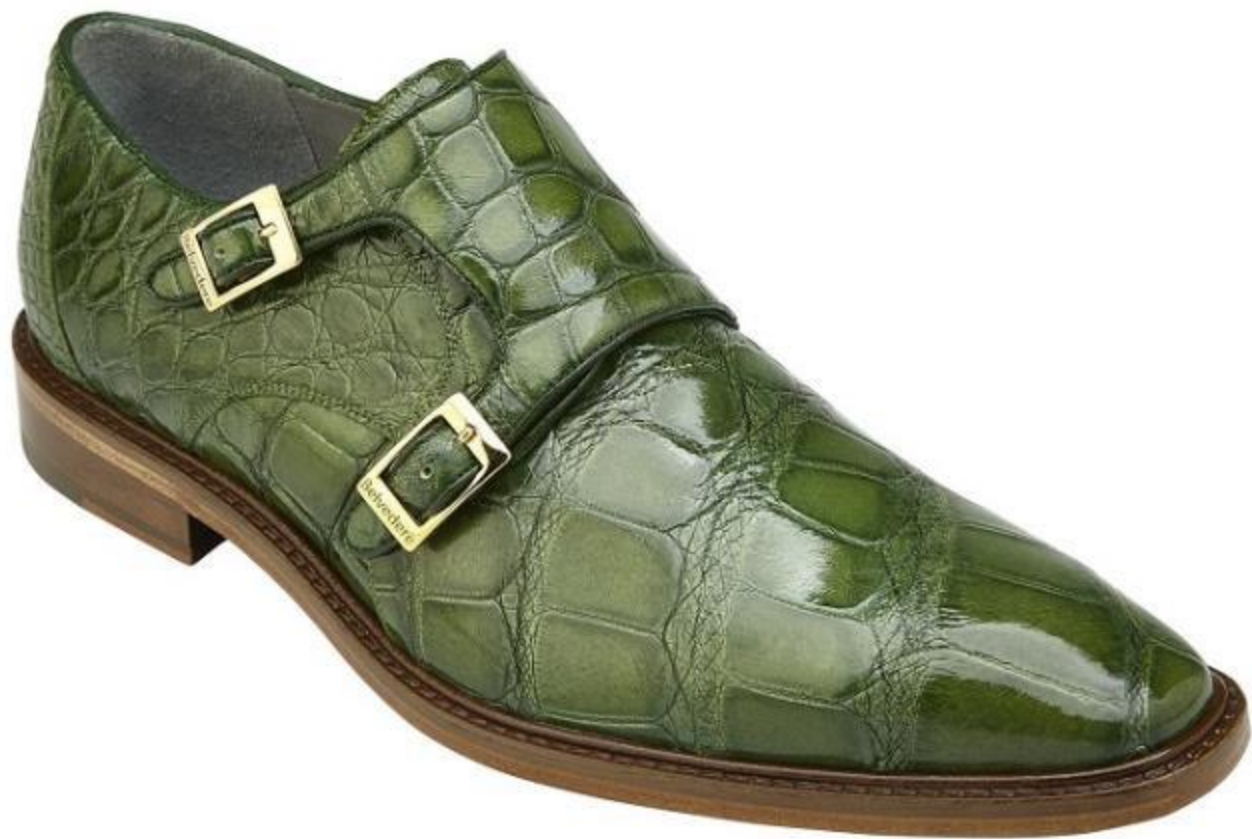
Alligator skin shoe