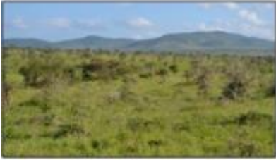
Tropical Grassland (Savannah)