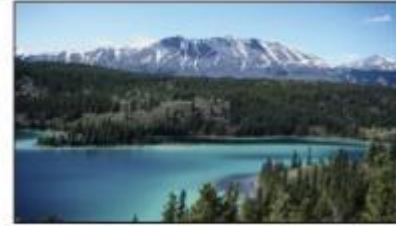
Coniferous Forest (Taiga)