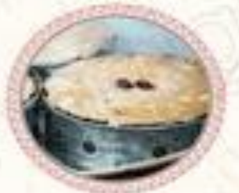
Niangao (Glutinous Rice Cake)