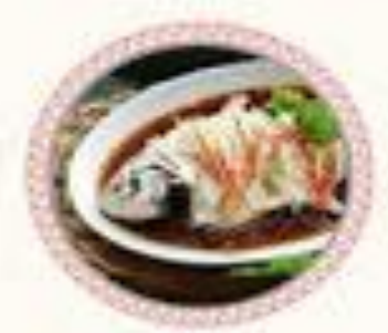
Fish — an increase in prosperity