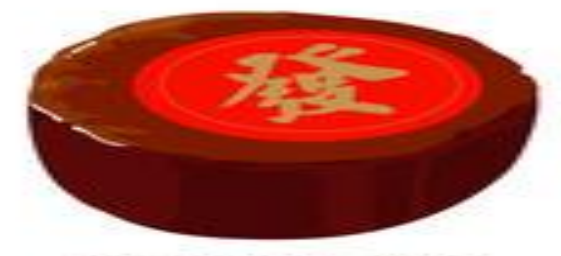
Nian Gao 年糕