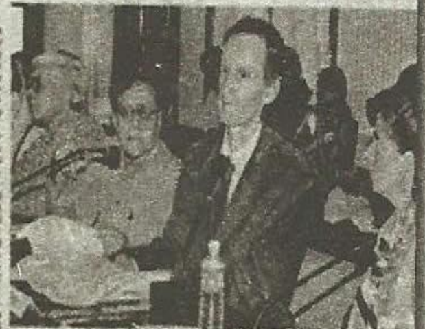
SPREADING A WARNING: From left, U.S. vice president Al Gore, president of the Intergovernmental Panel on Climate Change, and other leaders, speak at a news conference in Washington, D.C., after the release of the IPCC report on climate change.

The IPCC report says that the world's water resources are already under stress and that the situation will worsen if climate change continues. The IPCC report says that the world's water resources are already under stress and that the situation will worsen if climate change continues.