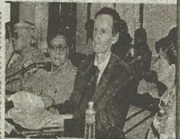
ISSUING A WARNING From left: U.S. vice president of the United Nations, Secretary-General of the United Nations, and other officials, after the release of the report on climate change.

He said that the world's population will be under increasing pressure to find ways to cope with the shortage of water.