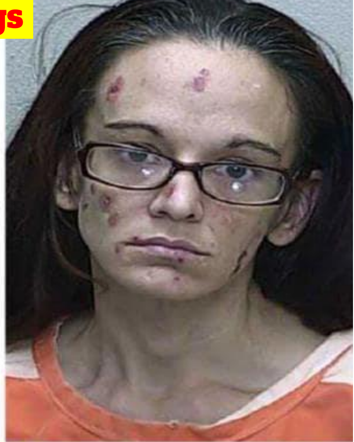
2 AGE: 31