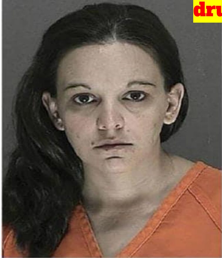
1 AGE: 29